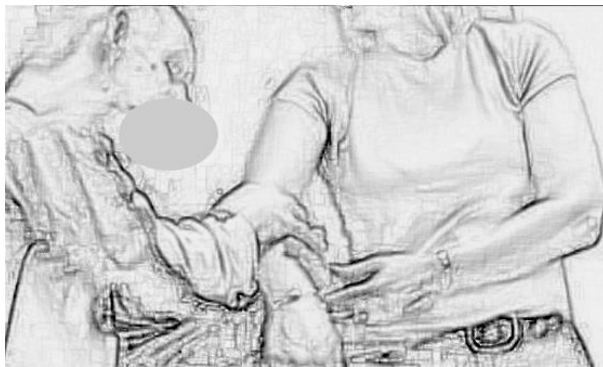
Figure 2 - David (left) uses his right hand to restrain SW2's progress

05 Dav [((brings right arm up to grasp and restrain SW2's holding arm,