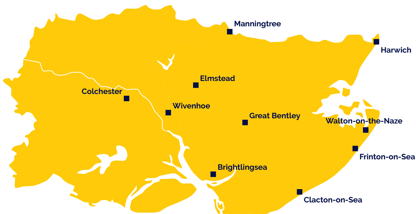
Figure 1: Colchester and Tendring Area Map

This Report provides an evidence-based rationale for the support of community assets to improve the health and wellbeing outcomes of citizens in North East Essex (see Figure 1). There is a focus on populations considered to be at increased risk of poor health and wellbeing outcomes, and on addressing populations in places where there are areas of comparative social deprivation in the context of growing health inequalities in the region.