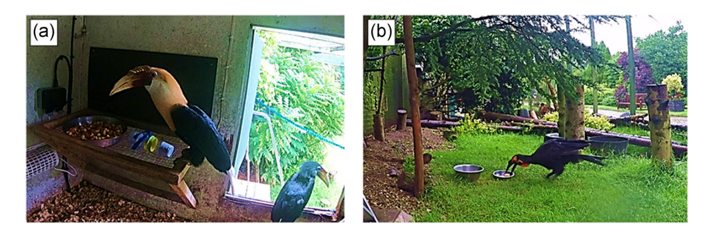
FIGURE 1 (a) Novel object condition with a pair of Blyth's hornbills ( Rhyticeros plicatus ). (b) Novel food condition with a Southern ground hornbill ( Bucorvus leadbeateri ) that is pecking at the orange jelly [Color figure can be viewed at wileyonlinelibrary.com]