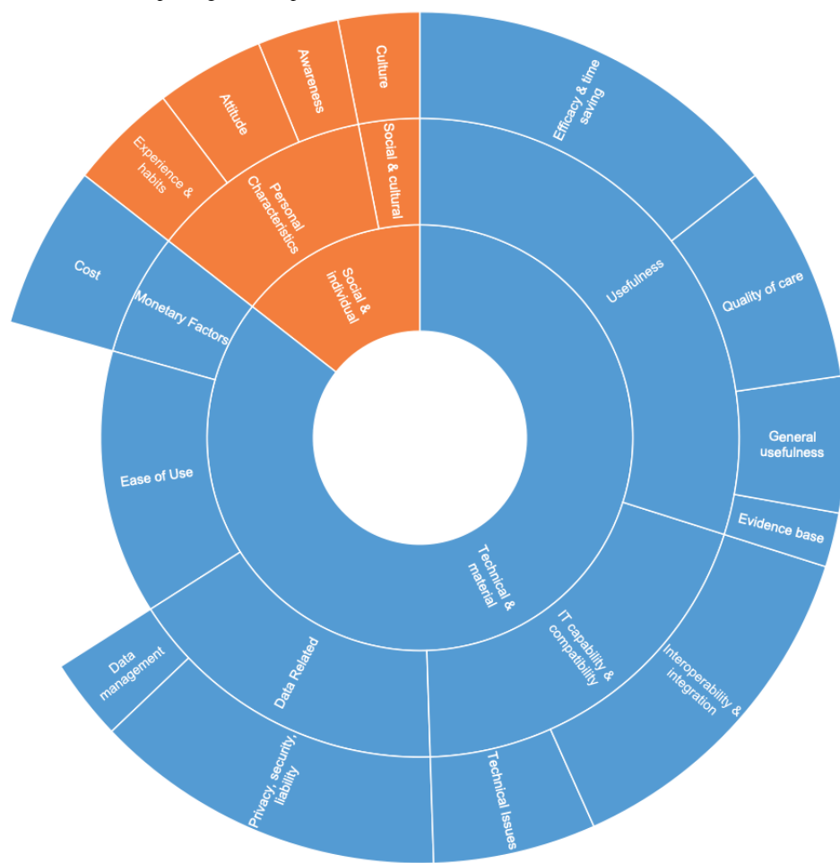
Figure 2. Technical and social factors impacting user adoption.