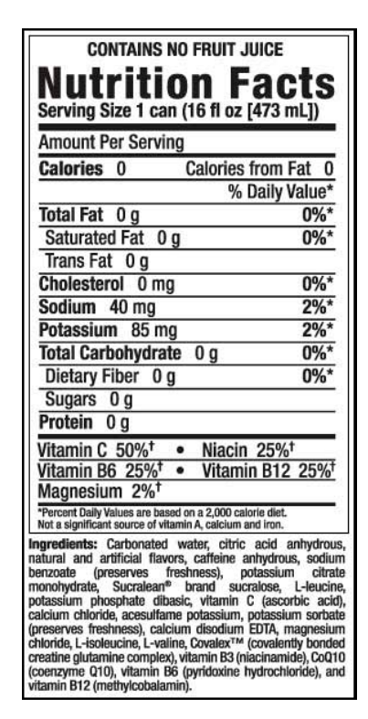
Figure 1. Nutrition Facts panel of BANG energy drink.