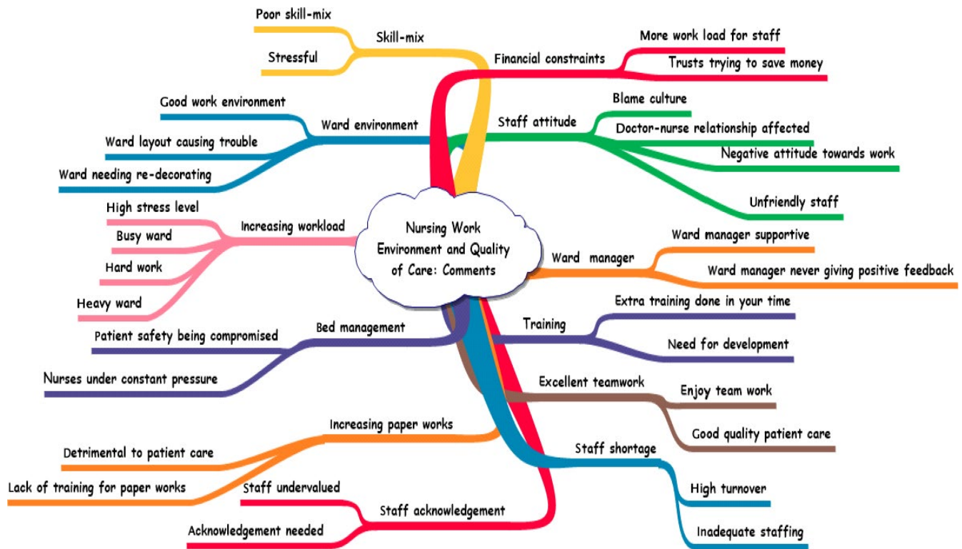
FIGURE 2 Creating categories phase