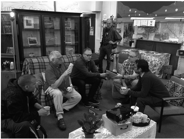
Fig. 2. Exchanging energy stories at the Story Studio, Treherbert (2015). Image – Lisa Heledd Jones, Storyworks UK (July, 2015).

themes of energy and landscape, we created a setting where past and present everyday appliances, local film and photograph archive, and landscape maps were exhibited and used as prompts (Fig. 2). We also used audio excerpts from the Ynysybwll oral histories to stimulate deliberation and discussions amongst visitors.