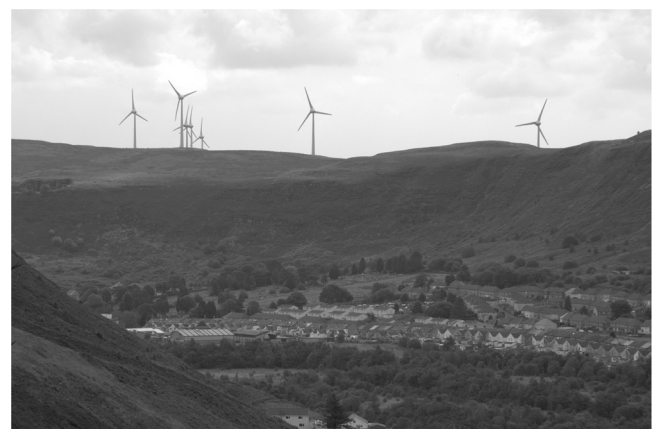
Fig. 4. New Energy Landscapes – Wind turbines on the hilltops between the Rhondda Fach and Rhondda Fawr valleys (2015).

Factors influencing public attitudes towards windfarms have been extensively researched (Wolsink, 2000, 2007; Devine-Wright and Howes, 2010; Devine-Wright, 2013). Unsurprisingly, in our study, arguments such as inefficiency and environmental damage were similarly repeated by some of those opposed. Perceptions of equity