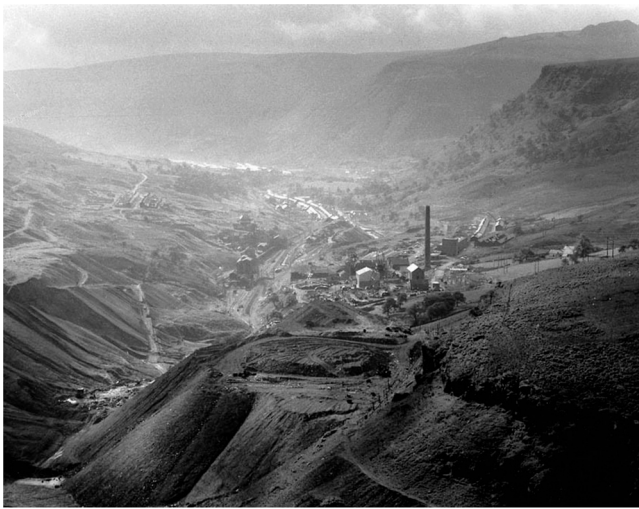
Fig. 3. Past Energy Landscapes – The Upper Rhondda Fawr valley looking south towards Treherbert showing working collieries and coal spoil tips (1965). Image produced courtesy of Rhondda Cynon Taf Archives.