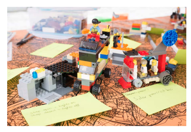
Fig. 2. London energy mapped and modeled at Utopia Fair.

covered the tabletop, and labelled with a sticky note. As the game progressed through numerous iterations the map became populated with a growing number of proposed solutions to London's energy challenges.