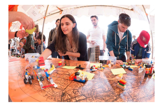
Fig. 1. Model London at Utopia Fair: building a future energy utopia with Lego and sticky notes.

In a second phase of the game, the opposing teams then collaborated to build the proposal (or an object representing the proposal) out of Lego, Plasticine and other building materials (Fig. 2). This object was placed in an appropriate location on a large-scale map of London that