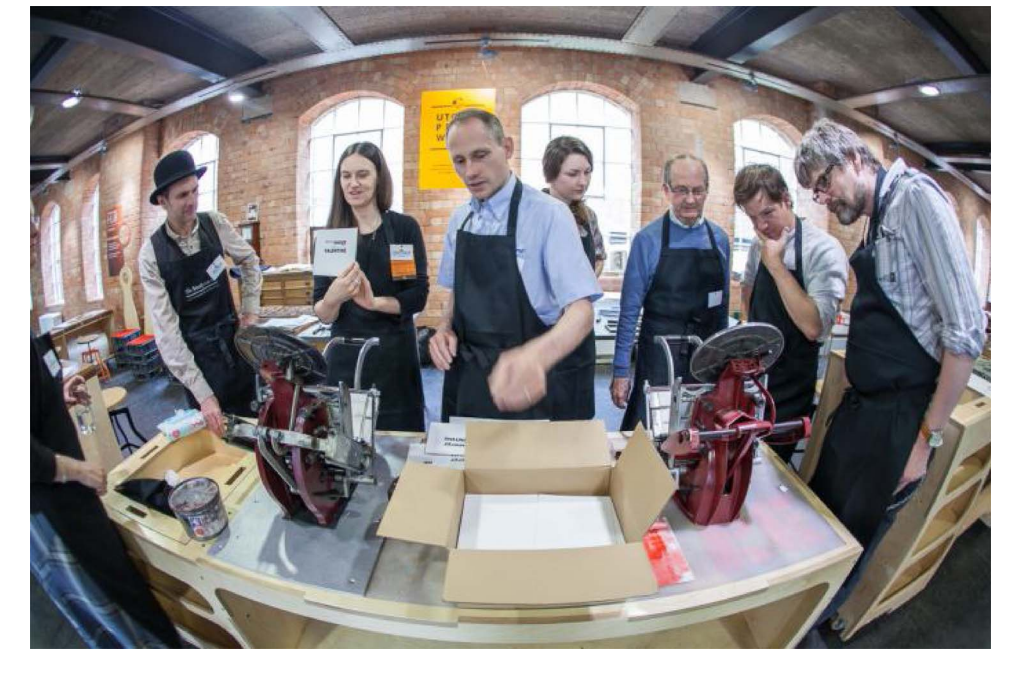
Fig. 4. Printing pamphlets on the letterpress, Utopia Works, Derby Silk Mill. Photo: Gorm Ashurst 2016.

In May 2016, in collaboration with creative and local partners, members of the south Wales based Everyday Lives strand of the Stories project organised a three-day event, the Creative Energy Festival , in the village of Ynysybwl in south Wales. Its main focus was a two-day Story Studio where we invited local residents to engage with the work we had done in the region up until that point, including Ynysybwl itself, exploring the past, present and future of energy in the South Wales valleys. The Studio followed a format that had been deployed in an earlier