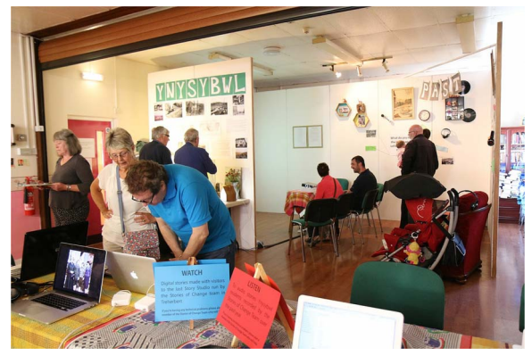
Fig. 6. The Story Studio, Ynysybwl.

Such personal and localised accounts allowed visitors to connect with the topic of energy through the narrators' experiences. As a result, listeners then shared their own stories of living in a community that was shaped by energy production, and the individual and collective challenges they face due to the legacy of the coal mining industry. Some were captured in brief glancing sentences on post-it notes as people responded to an image or something they had heard. In other cases people took time to share their oral histories with the research team, generating a more formally structured and recorded body of qualitative data. It was notable that while visitors were at ease sharing