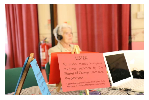
Fig. 5. Listening to digital stories, Ynysybwl. Photo: Lisa Heledd Jones, 2016.

phase of the Everyday Lives work. These valleys have been physically, economically and culturally shaped by coal extraction, and more recently have been the site of some of the biggest wind turbine arrays in the UK. After consultation with community partners, we chose the local community centre as the Studio's location, taking it over for the duration and transforming it into an interactive space designed to present our research and to invite people's responses to it. We created a setting for people to listen to short versions of oral history interviews that the team had conducted in the village in the summer of 2015, one year previously, which had specifically addressed the topic of energy (Fig. 5). Visitors could pick up wireless headphones playing the stories on a loop and listen to as much or as little as they liked. We also provided laptops and invited visitors to watch digital stories we had created with participants in separate research activity in another valleys village, Treherbert, in the previous summer.