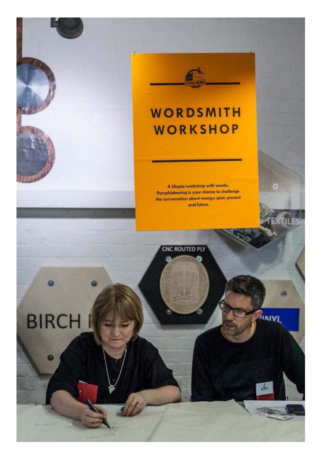
Fig. 3. Drafting pamphlets, Utopia Works, Derby Silk Mill.

hierarchical authority. Everyone was a team player and brought their unique knowledge, experience and limits to the table; we just worked together genially toward the team goal' [67]. A literature PhD student described the conclusion to the event in another blog post: