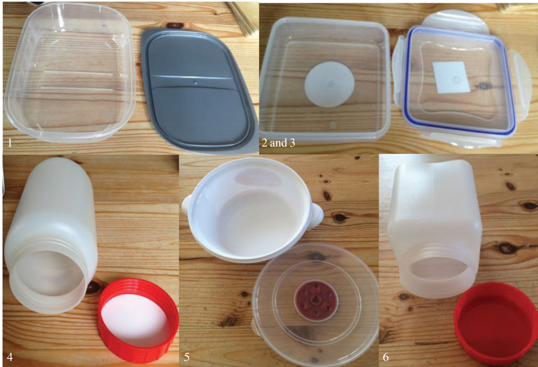
Figure 1. The novel extractive foraging tasks presented to the smooth-coated otters. (1) A simple plastic box ( 55 \times 175 \times 130 mm); (2) a plastic box with clips on the lid ( 45 \times 135 \times 135 mm); this box was used as both tasks 2 and 3, once with four clips closed (task 2) and then with two clips closed and two clips removed (task 3); (4) a round plastic jar with screw-top lid ( 180 \times 90 mm diameter); (5) a round plastic tub with a pull-off lid ( 70 \times 170 mm diameter); and (6) a square plastic jar with screw-top lid ( 180 \times 85 \times 85 mm). Each task was baited with half a fish and covered with its respective lid. The tasks are numbered in assumed order of difficulty with 1 being the easiest and 6 being the hardest.

have more trouble solving the task types that, from our personal experience opening the tasks, required more complex extractive foraging techniques (e.g. figure 1 tasks 5–6; figure 2 tasks 3–4), and would thus be more inclined to copy each others' solutions to those task types.