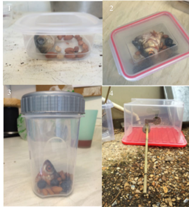
Figure 2. The novel extractive foraging tasks presented to the Asian short-clawed otters. These differ from those presented to the smooth-coated otters (figure 1), as in this second iteration of the experiment on the second study species we wanted to create a more explicit range of task difficulties. Tasks were also slightly smaller to accommodate the smaller size of this otter species. (1) A simple plastic box ( 40 \times 100 \times 100 mm); (2) a plastic box with two clips ( 45 \times 100 \times 85 mm); (3) a plastic tub with a screw-top lid ( 130 \times 75 mm diameter); and (4) a frozen reward on a bamboo cane that had to be moved up and to the right to fit through the hole. The numbering of the tasks is in intended order of difficulty, with 1 being the easiest, and 4 being the most difficult. These tasks were baited with peanuts and one fish head per task at the New Forest Wildlife Park, and peanuts and mealworms mixed with either half a mouse or day-old chick legs at Paradise Wildlife Park. Task 4 required a different type of reward due to its design, so this was a block of ice with shrimp or mealworms frozen inside.

than the TADA variant of NBDA [36], and here we did not have exact times of acquisition, so we initially used OADA. However, the social networks for Asian short-clawed otters were highly homogeneous (see Results), meaning OADA was unable to estimate the effect of social transmission with precision. We, therefore, also used a discrete TADA [35,36] to estimate the effects of social transmission for this species, with time divided into 1-min periods (see electronic supplementary material). This also allowed us to estimate the relative difficulty of each task for the Asian short-clawed otters.