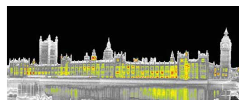
Figure 2: An infrared image of heat loss of the Houses of Parliament.

listed buildings put this figure at 1.5%. Assuming the same rate of carbon emissions for listed and unlisted building, it can be inferred from this that the contribution of designated historic buildings to carbon dioxide emissions must be around 0.25% of all carbon dioxide emissions [30].