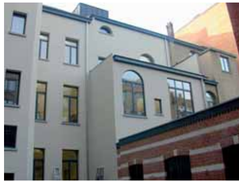
Figure 4: Front and back façade of the renewable energy house, Brussels, after refurbishment.

More often, the decision to reuse public heritage buildings are mostly based on finding suitable and sustainable economic use while, questions of energy consumption in these buildings are generally seen as secondary. Meanwhile, good technologies that can meet reduction of energy consumption in these buildings are currently available. The main obstacle to their implementation has been a general lack of their knowledgeable application. In demonstrating one of the good practices of these technologies, Zidar and Hrs Borković [42] provided evidence that highest savings in energy consumption can be achieved in all types of buildings by integrating energy efficiency measures in a harmonious energy system.