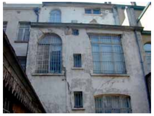
Figure 3: Front and back façade of the renewable energy house, Brussels, before refurbishment.