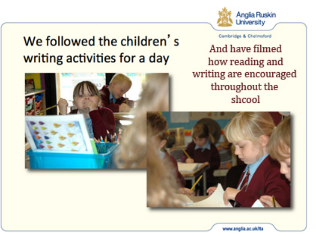
Figure 1: Children in Y1 write a story

The school run a writing project called the 'The Big Write', which we followed for a day in the school, filming writing activities in Y1, Y4, Y5/6 and then created an interactive website featuring film clips showing interviews with staff, Governors and the School Special Needs Co-ordinator and including interactive online activities for visitors to the website as well as links to key Government documents. Thus potential trainees have a much greater insight into how a primary school day is structured, as well as the roles and responsibilities of teachers in different year groups.