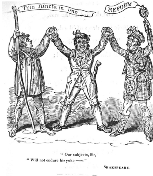
Fig. 1 3

their stories have often been hijacked by critics concerned with promoting the notion of an independent Scotland. But here I want to reconnect the rebellions in Scotland and England, and argue that they were the result of a government initiative designed to discourage revolution at a time when it appeared to many that one was imminent. 2