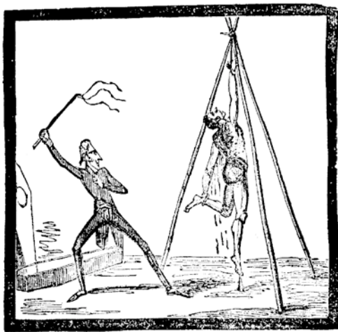
Fig. 4 67