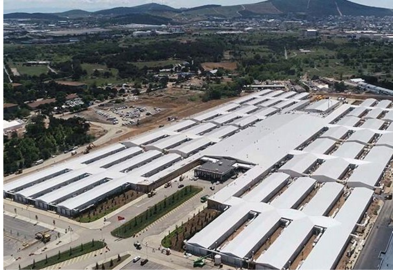
Prof. Dr. Feriha ÖZ Emergency Hospital Emergency Hospital – May 2020 1008 Bed