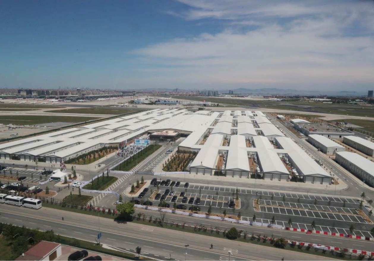
Yeşilköy Prof. Dr. Murat Dilmener Emergency Hospital – May 2020 1008 Bed