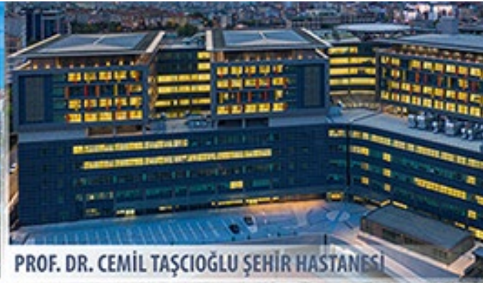
PROF. DR. CEMİL TAŞCIOĞLU ŞEHİR HASTANESİ