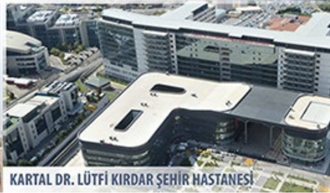
KARTAL DR. LÜTFİ KIRDAR ŞEHİR HASTANESİ