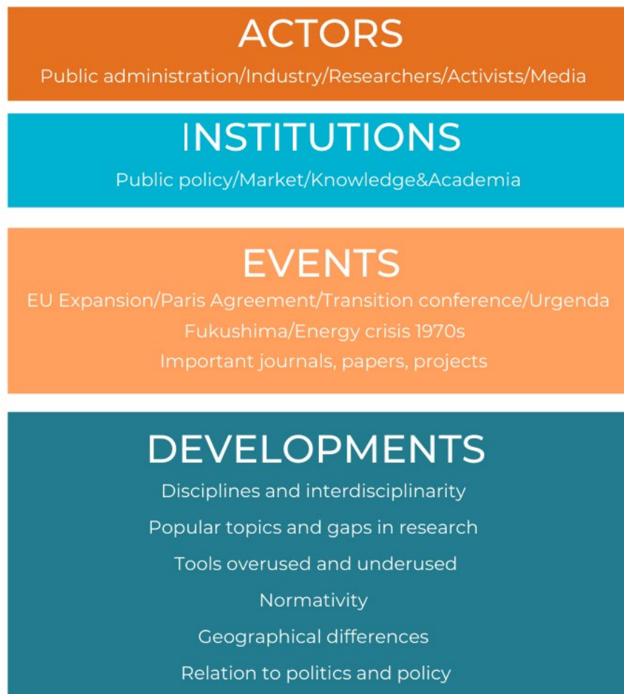
Figure 2. Frontrunners' view of the field

As regards to events, the introduction of specific policies, regulations and other broader events related to politics appears as the most important external force influencing developments in the field of SSH research on renewables. For example, the EU's enlargement in 2004 had a crucial impact on research in Central and Eastern Europe.